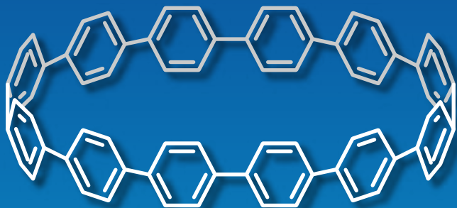
[12]Cycloparaphenylene (= [12]CPP) 10mg [C2449]

Cycloparaphenylenes (CPPs), in which benzene rings are bound to each other at their para positions, represent the shortest sidewall segment (carbon nanoring) of single-walled carbon nanotubes (SWCNTs). In 2009, Itami et al. have reported the first synthesis of [12]cycloparaphenylene (C2449), which is composed of twelve benzene rings. 1,2) Various applications using C2449 are expected.