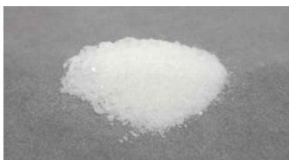
Appearance of A3437