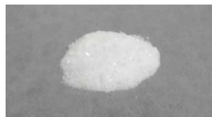
Appearance of P2877

More information for Compounds Purified by Sublimation is here. ▶▶▶ https://bit.ly/3DQgwJZ or