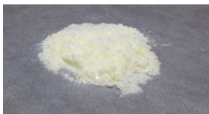
Appearance of A3436