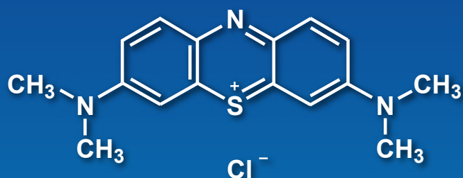
Methylene Blue Solution [M2392]