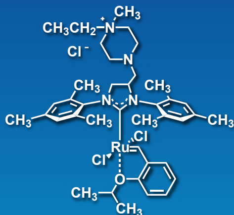
AquaMet 100mg / 500mg [A3009]