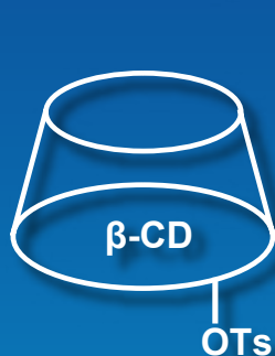
Mono-2-O-(p-toluenesulfonyl)- β-cyclodextrin 200mg [M1741]